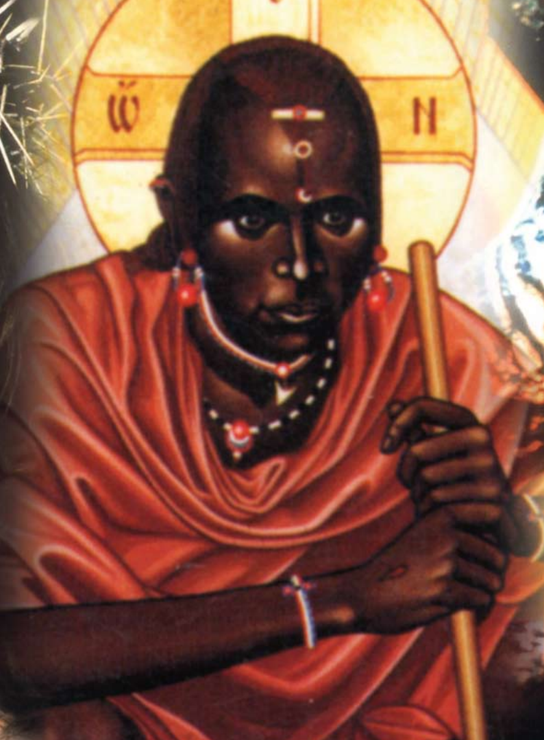
The Masai Christ.