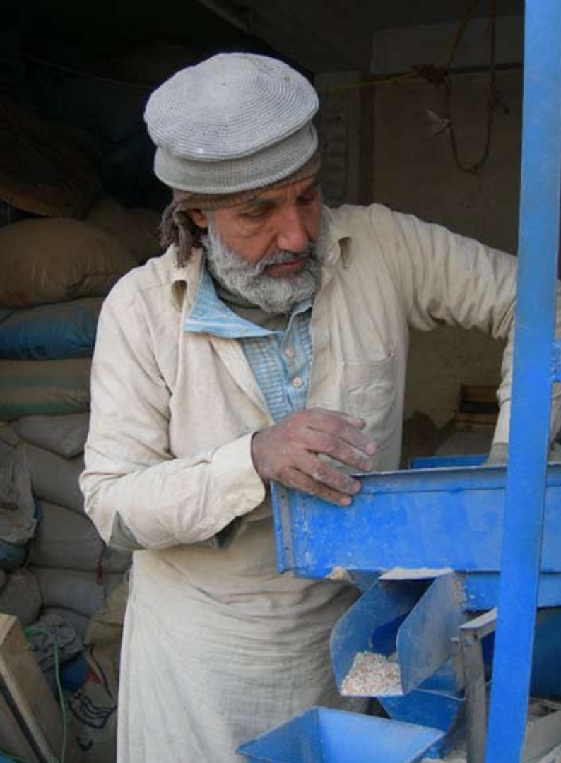
An ex-drug addict, helped by ICAN, now back at work.