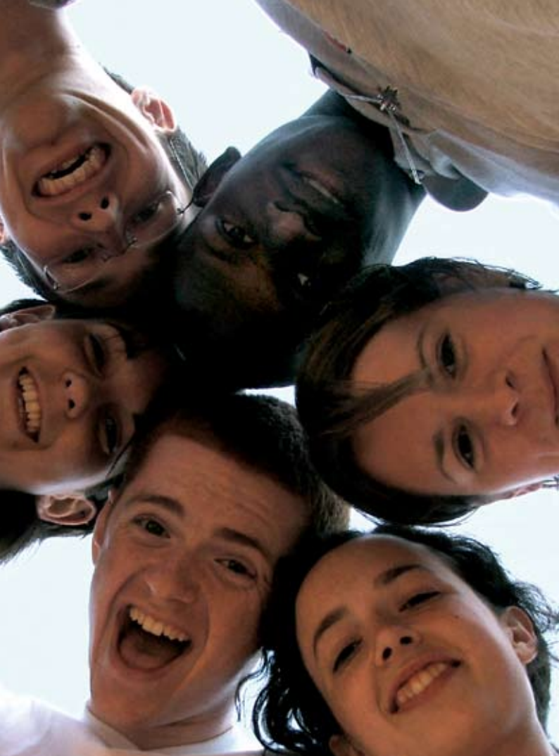
CMS ENCOUNTER Israel/Palestine group.